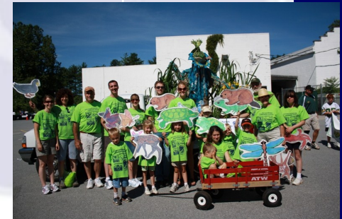
The Dutchess Watershed Coalition

A series of county-wide community outreach events based on watershed awareness in Dutchess County.